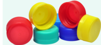
Loose bottle caps