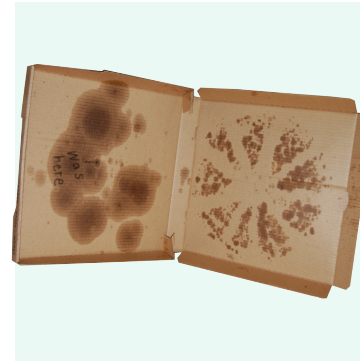
Greasy pizza box