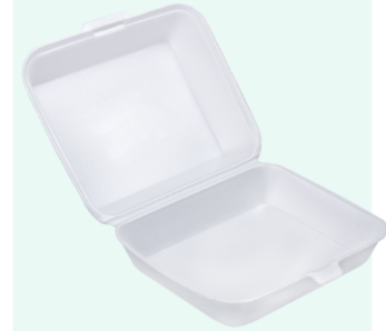
Foam food container