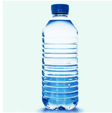
PET Plastic bottle