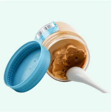
Dirty peanut butter jar