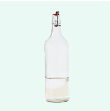
Glass bottle with some liquid