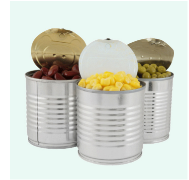
Tin can with food