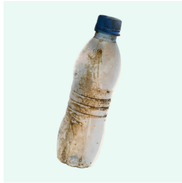
Dirty PET water bottle